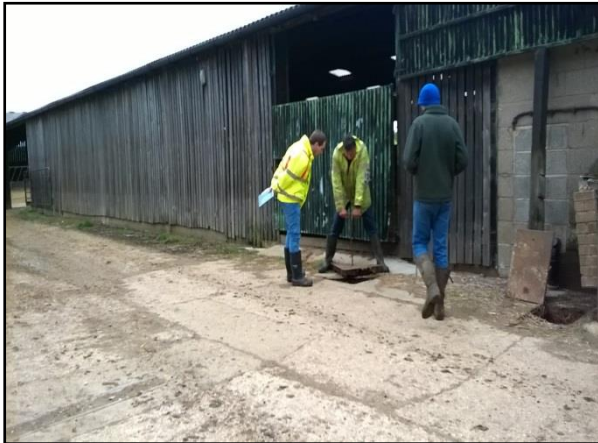
A site visit in Leicestershire

If the enquiry is regarded as requiring a site visit, this will be done by means of prioritisation and clustering and consequently, it may be some time before a site visit can be arranged in your area depending on the likely risk, current service demands and resources at the time.